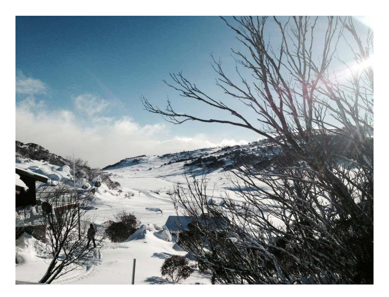
View from the Lodge from the Living Room, overlooking the large deck which includes outdoor seating and BBQ.